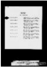
Stuart Lake Agency - Lejac Residential School - Payments Of Grants, 1917-1952 (2056027)