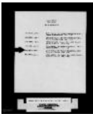
Lytton Agency - St. George's Residential School - Payment Of Grants, 1938-1943 (2057078)