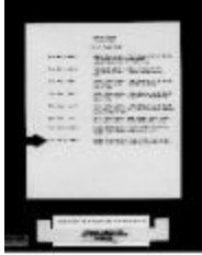
Skeena River Agency - Crosby Girls Residential School (Port Simpson) - Audit Reports, 1935-1948 (2056052)