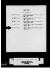
Kootenay Agency - Kootenay Residential School - Payments Of Grants, 1931-1951 (2056043)