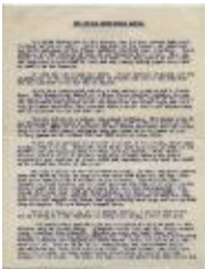
The Indian Residential School (MOA_20180215_005)