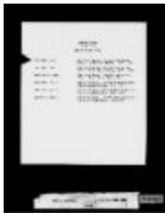
West Coast Agency - Ahousaht Residential School - Inspectors' Reports, 1933-1940 (2055993)