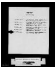
Lytton Agency - St. George's Residential School - Payments Of Grants, 1943-1951 (2057283)