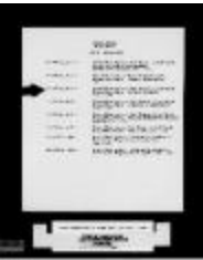
Skeena River Agency - Port Simpson United Church Residential School - Payments Of Grants, 1931-1948 (2056053)