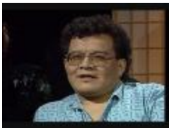
Rebirth in the face of darkness (38f-c001581-d0003-001)