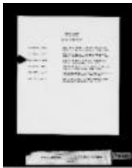
West Coast Agency - Ahousaht Residential School - School Land, 1930-1936 (2055996)