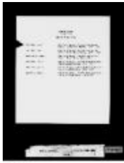
West Coast Agency - Ahousaht Residential School - Inspectors' Reports, 1933-1940 (2055993)