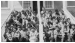
Morley Residential School with United Church (a034749)