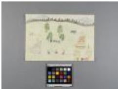
Drawing (537/19 i)