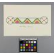
Drawing (537/19 c)