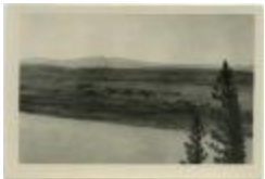
Scenes from Morley Indian Residential School, Morley, Alta.