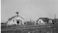
United Church and minister's house in Morley, Alberta (a034700)