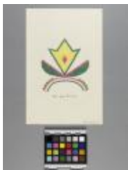
Drawing (537/19 b)