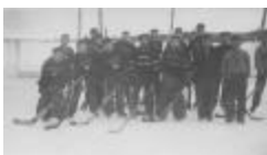
Hockey team, Morley, Alberta (a034740)