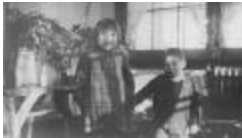
Stoney Nakoda girl and boy at Morley Residential School (a034741)