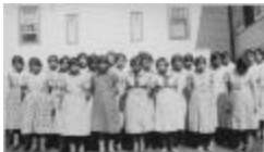
Stoney Nakoda girls at school (a034733)