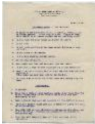
Classroom Rules for children and for teacher (MOA_20180215_006)