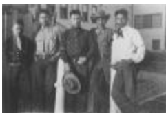
Senior boys at the Morley Residential School (a034662)