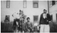
Stoney Nakoda family