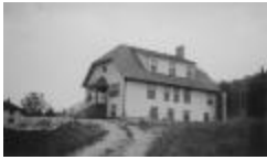
Hospital, Morley, Alberta (a034712)