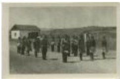
Morley Reservation school band (13d-c5705-d12)