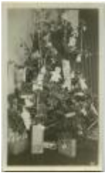
Christmas tree, Morley Indian school (13d-c5705-d9)