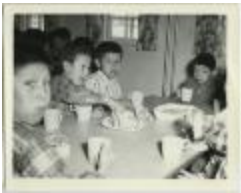
[Students of the Morley Indian Residential School] (13d-c5705-d20)