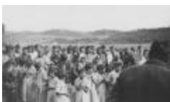
School children during visit by Governor General Lord Tweedsmuir, Indian Residential School and United Church, Morley, Alberta (a034664)