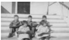
Five Children Sitting On The Steps (a034746)