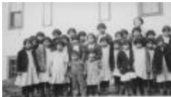
Junior girls at Morley Residential School (a034743)