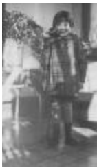
Young girl by note table at Morley Residential School (a034735)