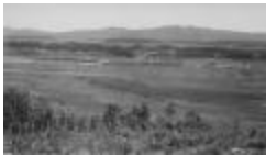
Morley, Alberta (a034670)