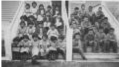
Junior class at Morley Residential School (a034742)