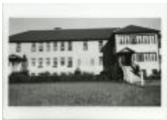
Morley Indian Residential School, Morley, Alta. (13d-c5705-d22)