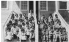
Junior Class of the Morley Residential School (a034729)