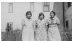
Senior girls at school, Morley (a034739)