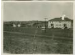
Morley Home And School (13d-c5705-d8)