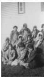
Stoney Nakoda girls at school (a034747)