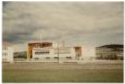
New school; 4 rooms, apt [apartment], office and basement rooms [Morley Residential School] (13d-c5705-d3)