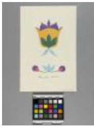
Drawing (537/19 e)