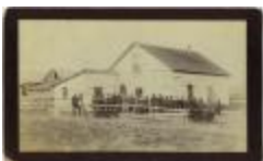
The second orphanage at Morley, Alta. (13d-c5705-d5)