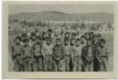
[Indian boys and teachers, Morley Residential School] (13d-c5705-d11)