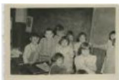
Scenes from Morley Indian Residential School, Morley, Alta. (13d-c5705-d18)