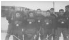
Hockey team, Morley (a034752)