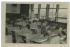
Scenes from Morley Indian Residential School, Morley, Alta. (13d-c5705-d14)