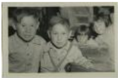
Scenes from Morley Indian Residential School, Morley, Alta. (13d-c5705-d16)