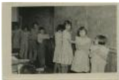
Scenes from Morley Indian Residential School, Morley, Alta. (13d-c5705-d17)