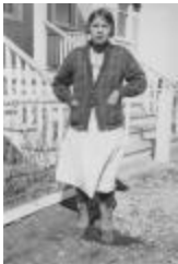
Stoney Nakoda girl at school (a034744)