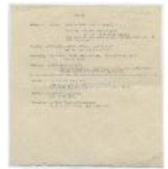
Duties at Morley Indian Residential School (MOA_20180215_004)