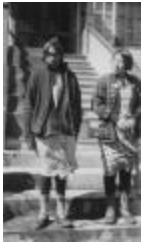
Two Senior Girls At School (a034745)