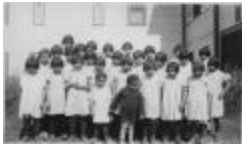
Junior division at the Morley Residential School (a034731)