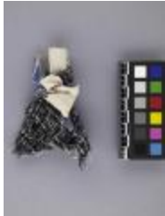
Doll (537/9 a-c)