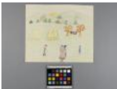
Drawing (537/19 g)