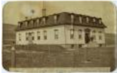
McDougall Orphanage for Indian children, Morley Alta. (13d-c5705-d6)