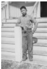
Stoney Nakoda boy at Morley Residential School (a034736)