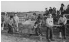
Young boys playing "Stampede" in Morley, Alberta