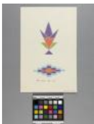
Drawing (537/19 d)