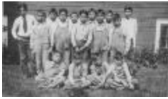
Stoney Nakoda boys in Senior division at Morley Residential School