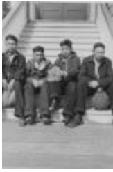
Stoney Nakoda Senior boys at school (a034753)