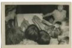
Scenes from Morley Indian Residential School, Morley, Alta. (13d-c5705-d15)