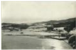
United Church mission and Indian Residential School, Morley, Alta. (13d-c5705-d21)