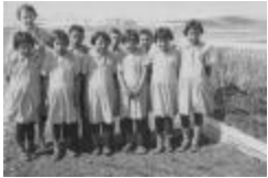
Part Of Junior Choir (a034734)