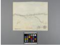
Drawing (537/19 f)