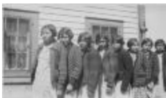
Senior Girls Ready For Church (a034732)