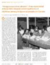
"Hunger was never absent": How residential school diets shaped current patterns of diabetes among Indigenous peoples in Canada (UBC_20180406_001)