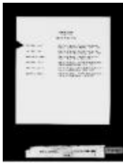
West Coast Agency - Ahousaht Residential School - Inspectors' Reports, 1933-1940 (2055993)