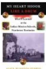
My heart shook like a drum : what I learned at the Indian Mission schools, Northwest Territories (4424819)