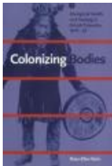
Colonizing bodies : Aboriginal health and healing in British Columbia, 1900-50 (2835556)