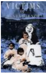
Victims of benevolence : the dark legacy of the Williams Lake Residential School (2834378)