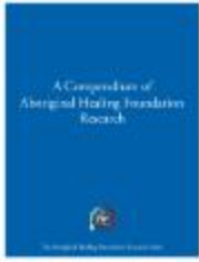
A compendium of Aboriginal Healing Foundation research (8120118)