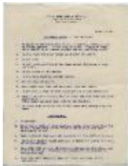
Classroom Rules for children and for teacher (MOA_20180215_006)