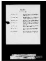
Williams Lake Agency - Caribou Residential School - Cadet Corps Band Set - Accounts, 1945-1946 (2056009)