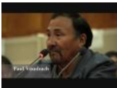
It's About Courage (MDNNE111b)