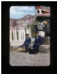
Two unidentified boys and a totem (UCCPMR_20180221_002)