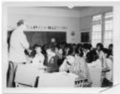
[Teacher and class, Alberni Indian Residential School] (13d-c5699-d12)