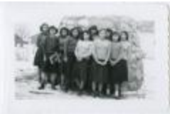
C.G.I.T. girls (not in uniform) in front of the cairn, Round Lake Residential School, Sask. (13d-c5710-d10)