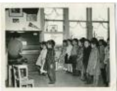
[Children performing a song with actions, Norway House Indian Residential School, Man.] (13d-c5712-d13)