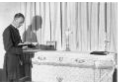
Chapel at Indian Residential School at Lytton (13a-c005010-d0001-001)