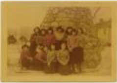
C.G.I.T. group in Sunday clothes with cairn back of them, Round Lake Residential School, Sask. (13d-c5710-d11)