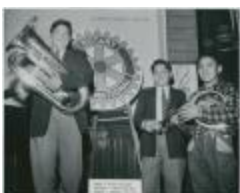
ST. THOMAS FESTIVAL, Nov. 1956 (13d-c5715-d61)