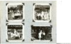
Cérémonies religieuses en 1959-1960 (45p-c000006-Cérémonies 1959)