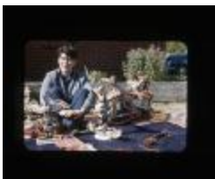
Unidentified young man with indigenous art (UCCPMR_20180221_005)