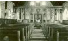
Chapel at Indian Residential School at Lytton (13a-c005010-d0004-001)