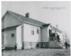
THE OPENING OF THE NEW ONEIDA #4 SCHOOL. November 19, 1953. (13d-c5715-d49)