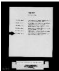
Lytton Agency -St. George's Residential School - Payments Of Grants, 1943-1951 (2057283)