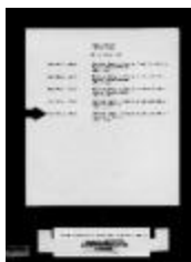
Kootenay Agency - Kootenay Residential School - Payments Of Grants, 1931-1951 (2056043)