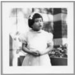
Photograph, 1959 (10a-c000432-d0013-001)