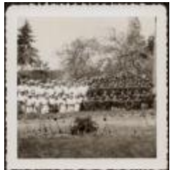
Photograph, May 1952 (10a-c000479-d0011-001)