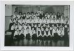
C.G.I.T. group, Norway House Indian Residential School (13d-c5712-d24)