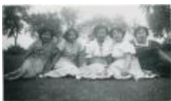
Part of the Senior Sewing Class, 1951-1952 (13d-c5713-d5)