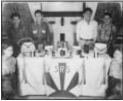
Photograph, 1958 (10a-c000480-d0054-001)