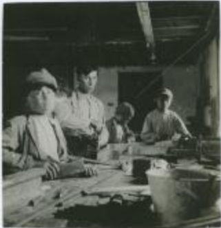
[Carpentry class, Brandon Industrial Institute] (13d-c5711-d22)