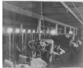
[Cows in stalls in the dairy barn, Brandon Institute] (13d-c5711-d32)