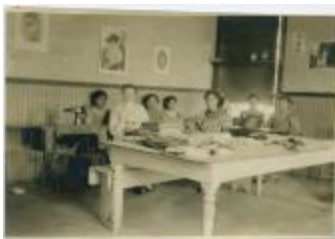
[Sewing class, Brandon Industrial Institute] (13d-c5711-d13)