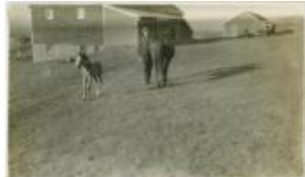
[The new filly, Brandon Institute] (13d-c5711-d45)