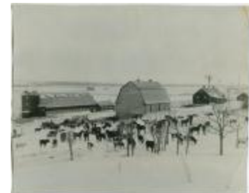
General view of the barns and livestock, Brandon Institute (13d-c5711-d25)