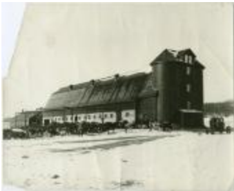
[Cows outside the dairy barn, Brandon Institute] (13d-c5711-d26)