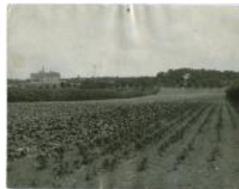
View of the Brandon Indian Institute and garden, Brandon, Man. (13d-c5711-d23)