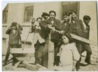
Children at the Brandon Indian School (13d-c5711-d20)