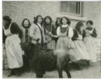
Girls, Brandon Indian School (13d-c5711-d21)