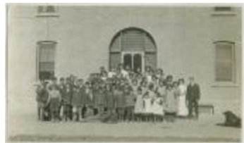
Scholars and staff, Brandon Institute (13d-c5711-d46)