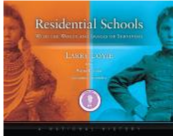
Residential schools : with the words and images of survivors (7873518)