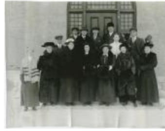
Staff of the Brandon Institute (13d-c5711-d35)