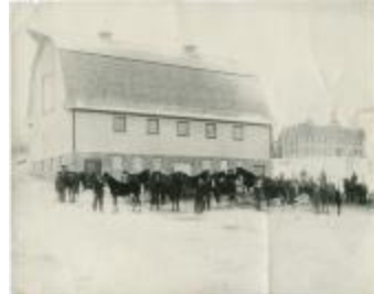
[Horses outside the barn in winter, Brandon Institute] (13d-c5711-d29)