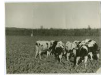
Cows in the garden, Brandon Institute (13d-c5711-d24)