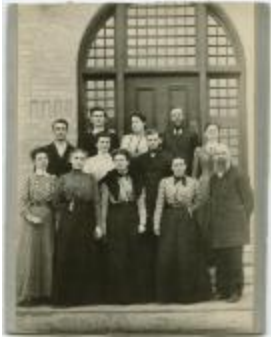
Staff of the Brandon Indian Industrial Institute (13d-c5711-d7)