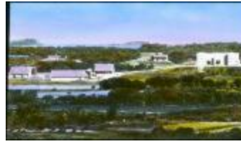
Brandon Indian Inst., Man. (13d-c5711-d58)