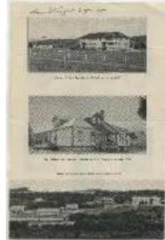
Morley Indian Residential School. rebuilt in 1935 (MOA_20180215_001)