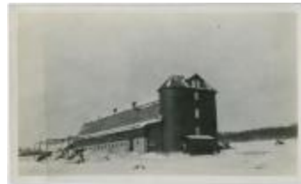
Dairy barn and silos, Brandon Institute (13d-c5711-d40)