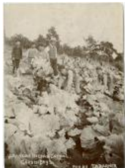
[Garden boys harvesting cabbages under the watchful eye of their instructor, Brandon Indian School farm] (13d-c5711-d16)