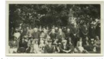
Scholars and staff, Brandon Institute (13d-c5711-d43)