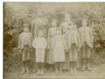
[Some staff and students of the Brandon Industrial Institute] (13d-c5711-d11)