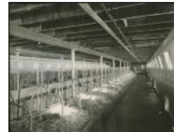
[Interior of the dairy barn, Brandon Institute] (13d-c5711-d31)