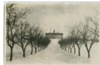
Brandon Indian Institute in winter (13d-c5711-d49)