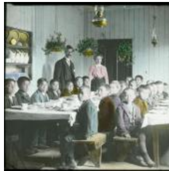
[Brandon boys in the dining room, Brandon Industrial Institute] (13d-c5711-d5)