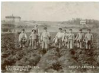
[Garden boys, Brandon Indian School : boys and their instructor showing some of the fruits of their labours in the carrot patch] (13d-c5711-d17)