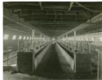
[Interior of the dairy barn, Brandon Institute] (13d-c5711-d30)