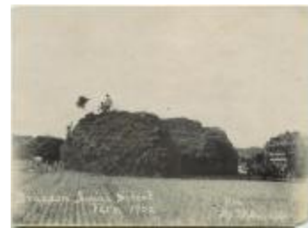
[Bringing in the hay, Brandon Indian School farm] (13d-c5711-d14)