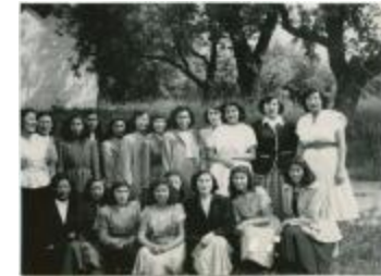
This Snap Was Taken A Year Ago, So All Our Big Girls Are Not Here Now (13d-c5711-d4)