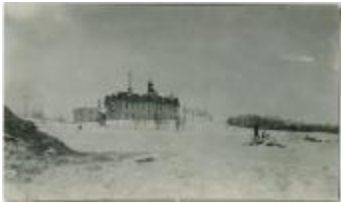
Brandon Indian Institute, Man. (13d-c5711-d51)