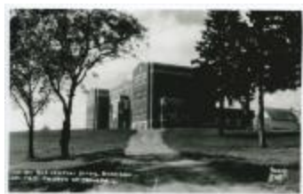
Indian Residential School, Brandon.