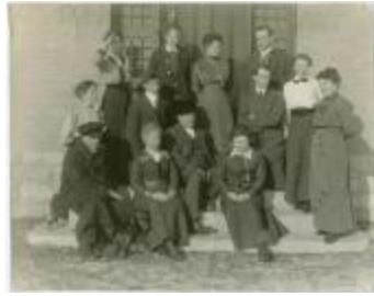
Staff of the Brandon Institute (13d-c5711-d34)