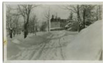
Brandon Institute in winter (side view) (13d-c5711-d41)