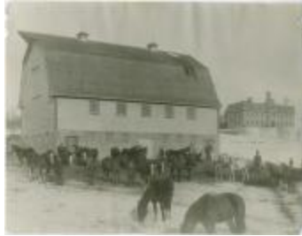
[Horses outside the barn in early spring, Brandon Institute] (13d-c5711-d28)