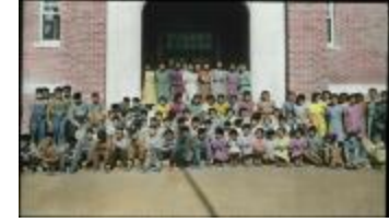
Pupils in front of Brandon Residential School, Man. (13d-c5711-d57)