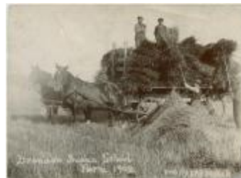
[Gathering stooks, Brandon Indian School farm] (13d-c5711-d15)