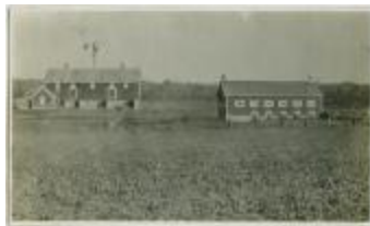
[Barns and pasture, Brandon Industrial Institute]