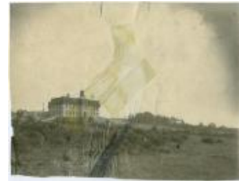
[Brandon Industrial Institute, Brandon, Man.] (13d-c5711-d9)