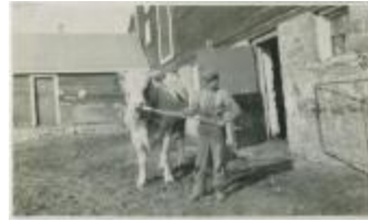
[Handling a bull, Brandon Industrial Institute] (13d-c5711-d47)