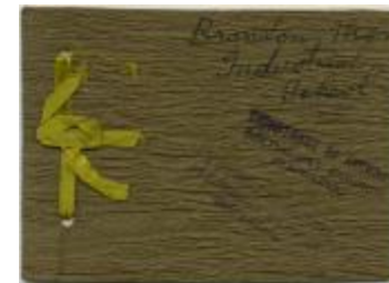
With heartiest Christmas greetings ... from the principal and staff of the Indian Industrial School, Brandon, Man. (13d-c5711-d54)