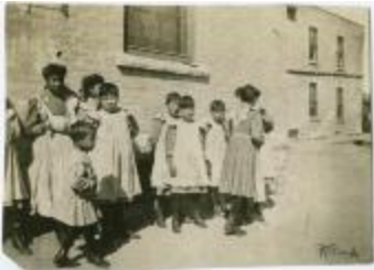
Girls at the Indian school in the great lone land, Brandon, Man. (13d-c5711-d19)