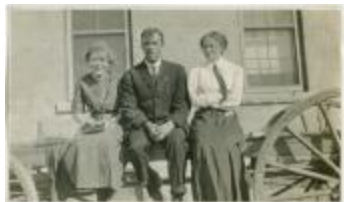
[Three staff members sitting on a fence, Brandon Institute] (13d-c5711-d44)