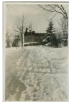
[Brandon Institute in winter (side view)] (13d-c5711-d50)