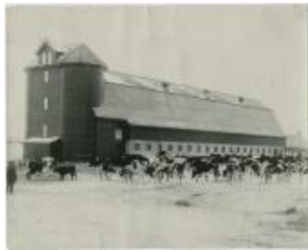
[Cows outside the dairy barn in winter, Brandon Institute] (13d-c5711-d27)