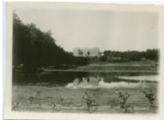
Brandon Indian Institute, Man. (13d-c5711-d53)