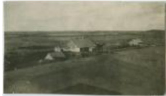
The Farm Buildings And Some Of The Fields Ready For Seeding (13d-c5711-d36)