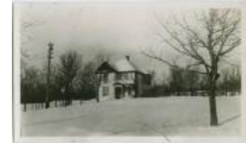
House of the instructor in carpentry, Brandon, Man. (13d-c5711-d38)