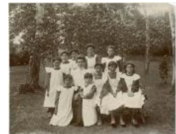
S.S. class, Brandon Industrial Institute (13d-c5711-d12)