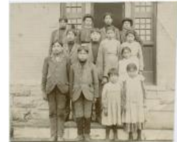
[Students of the Brandon Industrial Institute] (13d-c5711-d10)