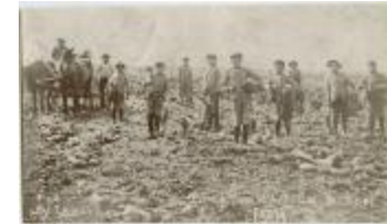
[Harvest time in the vegetable garden, Brandon Indian School farm] (13d-c5711-d18)