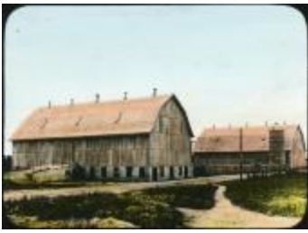
Barn at Brandon (13d-c5711-d55)