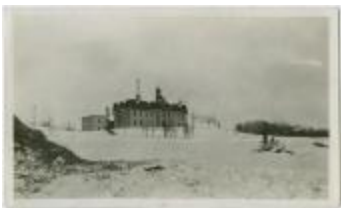
Brandon Institute (13d-c5711-d39)