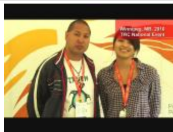
Sharing Corner (MDWNE115b)