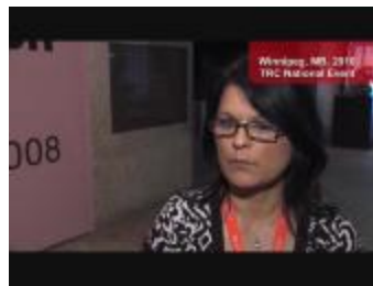
Older Than America (MDWNE110b)