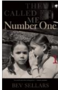
They called me number one : secrets and survival at an Indian residential school (6549711)