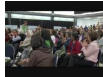
How to Tell My Kids (MDNNE109)