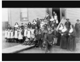
Truth Walkers (MDANE109a)