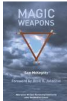
Magic weapons : Aboriginal writers remaking community after residential school (3913987)