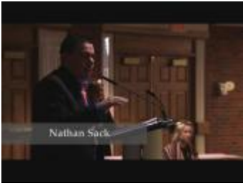
Teaching Our Children (MDANE108)