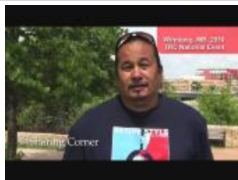
Sharing Corner (MDWNE114b)