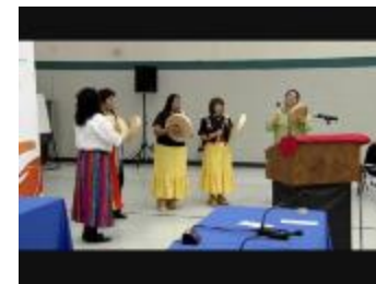
Ontario Hearings (MDOCE102)