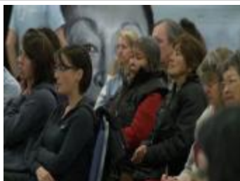
Screening of Hope (MDNNE118a)