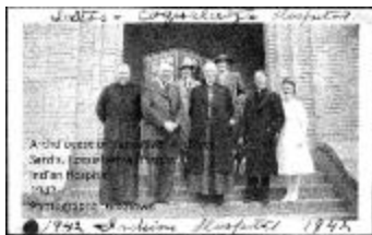
Sardis, Coqualeetza Indian Hospital - Indian Hospital (38b-c000819-d0002-001)