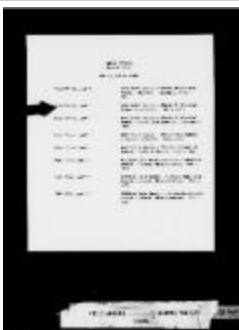
West Coast Agency - Alberni Residential School - Livestock, 1931-1940 (2055999)