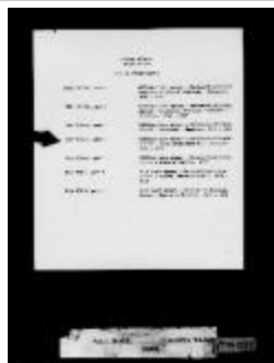
Williams Lake Agency - Caribou Residential School - Cadet Corps Band Set - Accounts, 1945-1946 (2056009)