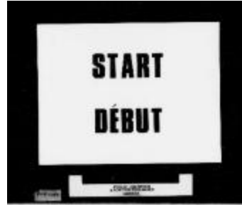
Kootenay Agency - Kootenay Residential School - Livestock - Accounts, 1925-1944 (2096121)