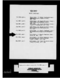
Lytton Agency - St. George's Residential School - School Land, 1891-1929 (2056071)