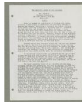
The Emotional Needs Of Our Children (38f-c000924-d0004-004)