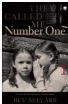
They called me number one : secrets and survival at an Indian residential school (6549711)