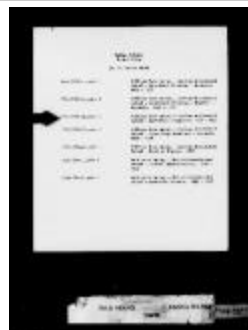
Williams Lake Agency - Caribou Residential School - Livestock - Supplies, 1927-1932 (2056008)