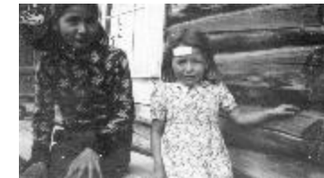
Photograph (10a-c101015-Lower Post - 2 gir)