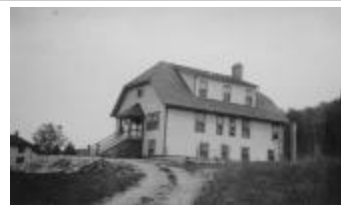
Hospital, Morley, Alberta (a034712)