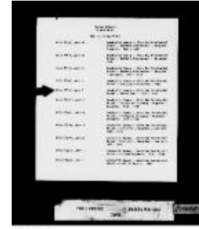
Kwawkwalth Agency - Alert Bay Residential School - School Land, 1932-1948 (2057052)