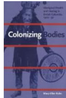
Colonizing bodies : Aboriginal health and healing in British Columbia, 1900-50 (2835556)