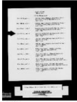
Kamloops Agency - Kamloops Residential School - Livestock - Supplies - Accounts, 1920-1938 (2056029)