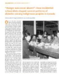
"Hunger was never absent": How residential school diets shaped current patterns of diabetes among Indigenous peoples in Canada