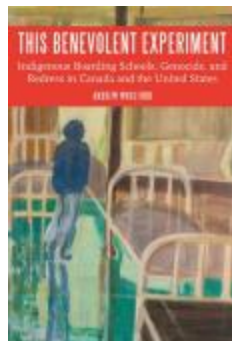
This benevolent experiment : indigenous boarding schools, genocide, and redress in Canada and the United States (7952414)