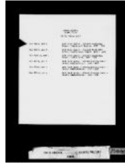
West Coast Agency - Ahousaht Residential School - Inspectors' Reports, 1933-1940 (2055993)