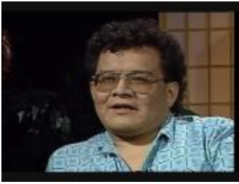
Rebirth in the face of darkness (38f-c001581-d0003-001)