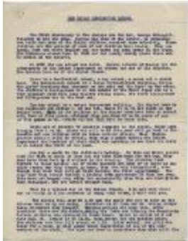
The Indian Residential School (MOA_20180215_005)