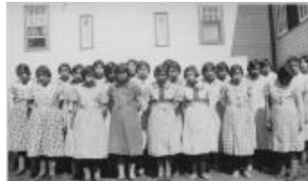
Stoney Nakoda girls at school (a034733)