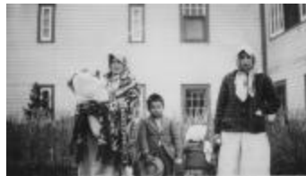
Stoney Nakoda family (a034748)