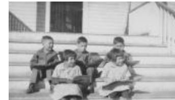
Five Children Sitting On The Steps (a034746)