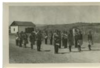
Morley Reservation school band (13d-c5705-d12)