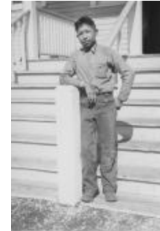
Stoney Nakoda boy at Morley Residential School (a034736)