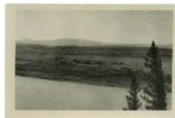
Scenes from Morley Indian Residential School, Morley, Alta. (13d-c5705-d13)