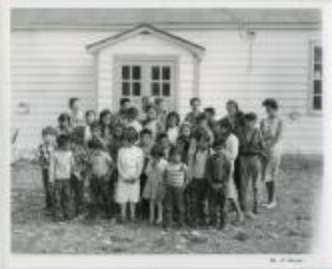
Students and teachers, Morley Indian Residential School (13d-c5705-d23)