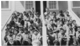
Morley Residential School with United Church (a034749)