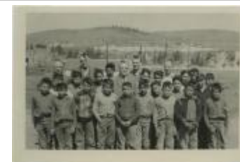
[Indian boys and teachers, Morley Residential School] (13d-c5705-d11)