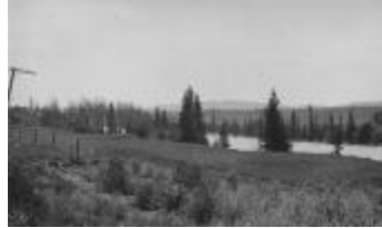
Bow River, Morley (a034669)