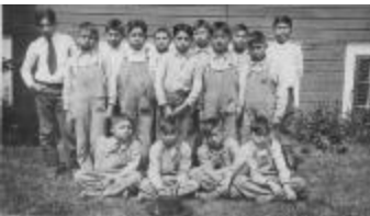
Stoney Nakoda boys in Senior division at Morley Residential School