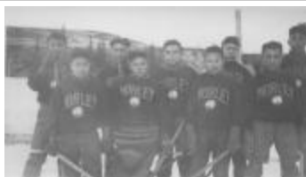
Hockey team, Morley (a034752)