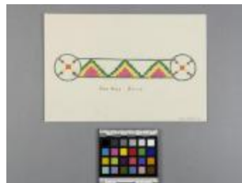
Drawing (537/19 c)