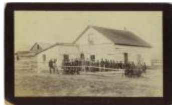
The second orphanage at Morley, Alta. (13d-c5705-d5)