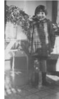
Young girl by note table at Morley Residential School (a034735)