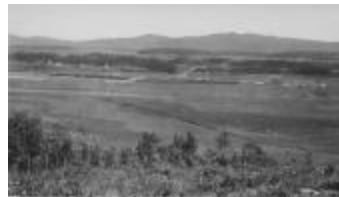
Morley, Alberta (a034670)