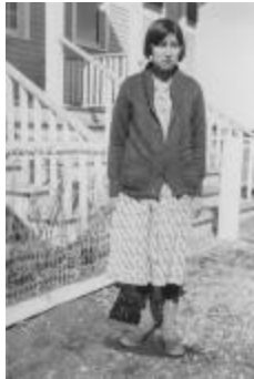
Stoney Nakoda girl in front of school building (a034694)