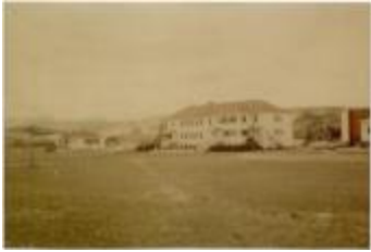
2-room day school, Residential s[school], New Day School [Morley Residential School] (13d-c5705-d2)