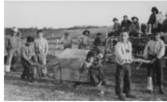
Young boys playing "Stampede" in Morley, Alberta (a034687)