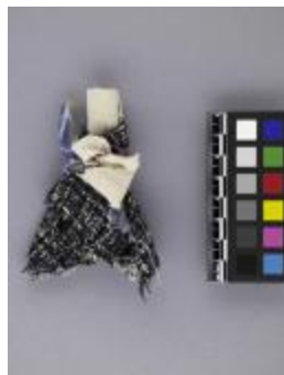
Doll (537/9 a-c)