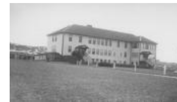
Morley Residential School after new wing was built (a034663)