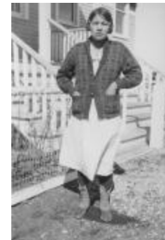
Stoney Nakoda girl at school (a034744)