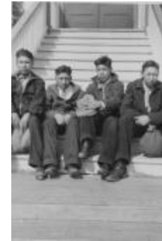
Stoney Nakoda Senior boys at school