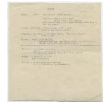
Duties at Morley Indian Residential School