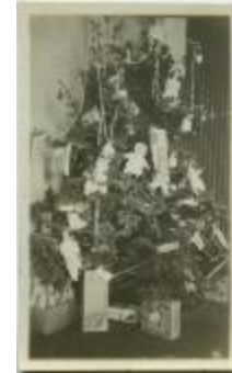
Christmas tree, Morley Indian school (13d- c5705-d9)