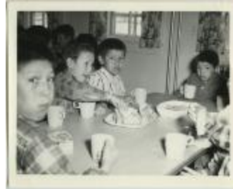
[Students of the Morley Indian Residential School] (13d-c5705-d20)