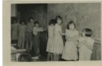
Scenes from Morley Indian Residential School, Morley, Alta. (13d-c5705-d17)