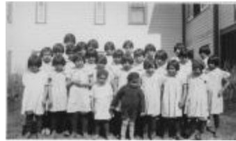
Junior division at the Morley Residential School (a034731)