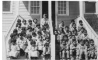
Junior Class of the Morley Residential School (a034729)