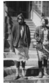
Two Senior Girls At School (a034745)