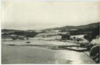
United Church mission and Indian Residential School, Morley, Alta. (13d-c5705-d21)