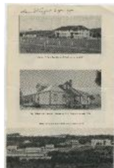
Morley Indian Residential School. rebuilt in 1935 (MOA_20180215_001)