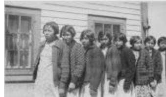
Senior Girls Ready For Church (a034732)