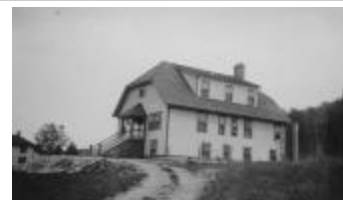
Hospital, Morley, Alberta