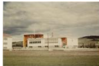
New school; 4 rooms, apt [apartment], office and basement rooms [Morley Residential School] (13d-c5705-d3)