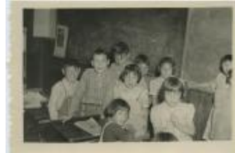
Scenes from Morley Indian Residential School, Morley, Alta.