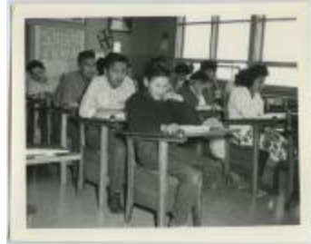
[Students of the Morley Indian Residential School] (13d-c5705-d19)