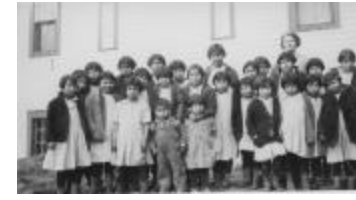
Junior girls at Morley Residential School (a034743)