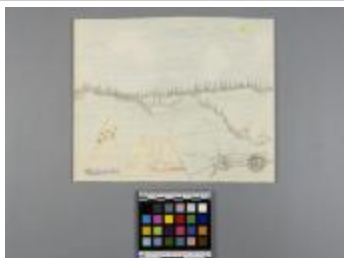
Drawing (537/19 f)