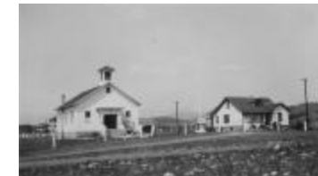
United Church and minister's house in Morley, Alberta (a034700)