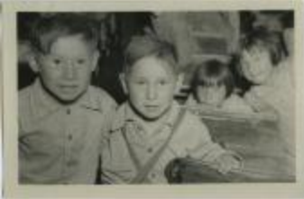
Scenes from Morley Indian Residential School, Morley, Alta. (13d-c5705-d16)