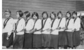
C.G.I.T. Canadian Girls in Training, United Church (a034751)