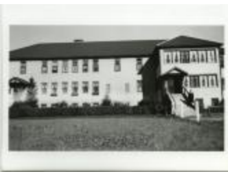
Morley Indian Residential School, Morley, Alta. (13d-c5705-d22)