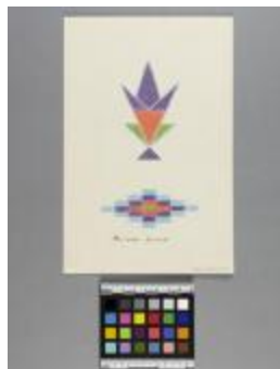
Drawing (537/19 d)