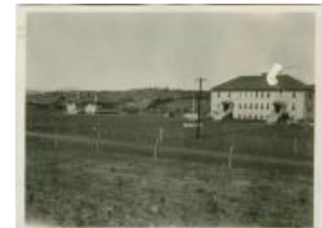
Morley Home And School (13d-c5705-d8)