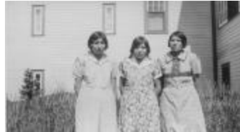
Senior girls at school, Morley (a034739)