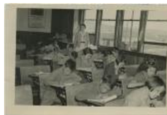
Scenes from Morley Indian Residential School, Morley, Alta.