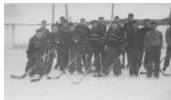
Hockey team, Morley, Alberta (a034740)