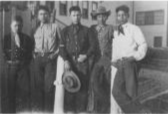
Senior boys at the Morley Residential School (a034662)