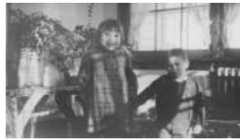
Stoney Nakoda girl and boy at Morley Residential School