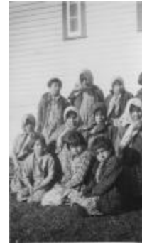
Stoney Nakoda girls at school (a034747)