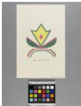
Drawing (537/19 b)