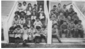
Junior class at Morley Residential School (a034742)