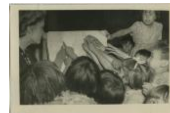
Scenes from Morley Indian Residential School, Morley, Alta. (13d-c5705-d15)