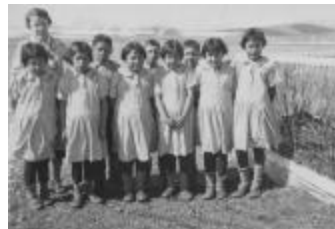
Part Of Junior Choir (a034734)