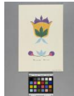
Drawing (537/19 e)