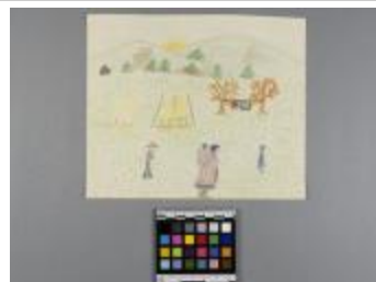
Drawing (537/19 g)