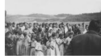
School children during visit by Governor General Lord Tweedsmuir, Indian Residential School and United Church, Morley, Alberta (a034664)