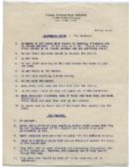
Classroom Rules for children and for teacher (MOA_20180215_006)