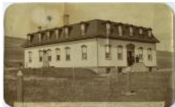
McDougall Orphanage for Indian children, Morley Alta. (13d-c5705-d6)