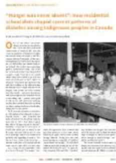
"Hunger was never absent": How residential school diets shaped current patterns of diabetes among Indigenous peoples in