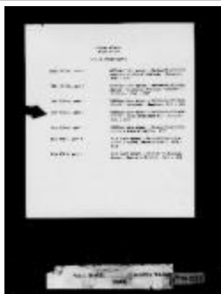
Williams Lake Agency - Caribou Residential School - Cadet Corps Band Set - Accounts, 1945-1946 (2056009)

We were children = Nous étions des enfants (6640149)