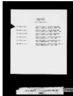
West Coast Agency - Ahousaht Residential School - Inspectors' Reports, 1933-1940 (2055993)

We were children = Nous étions des enfants (6640149)