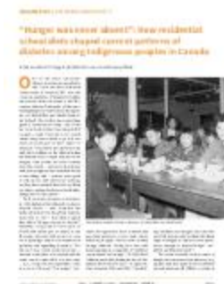
"Hunger was never absent": How residential school diets shaped current patterns of diabetes among Indigenous peoples in Canada