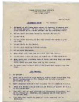
Classroom Rules for children and for teacher (MOA_20180215_006)