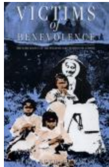
Victims of benevolence : the dark legacy of the Williams Lake Residential School (2834378)