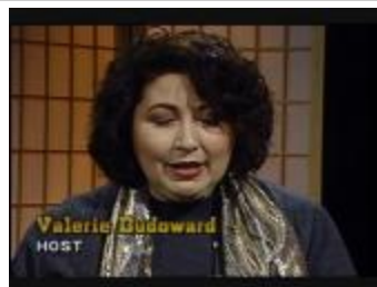
Rebirth in the face of darkness (38f- c001581-d0003-001)