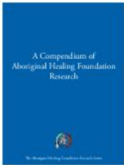
A compendium of Aboriginal Healing Foundation research (8120118)