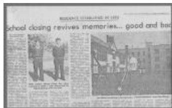
School Closing Revives Memories... Good And Bad (38f-c000527-d0001-001)

Stolen children : truth and reconciliation (5743095)