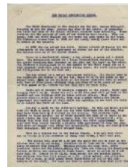
The Indian Residential School (MOA_20180215_005)

Stolen children : truth and reconciliation (5743095)